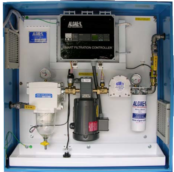
Inside view STS 6000-4GPM-S (shown with optional Separ primary filter)

STS 6000 Accessories: AFC-705 Fuel Catalyst, Wide range of filter elements, Rotor Sight Glass, Foot Valve, Separ Primary Filter, Two tank control, Digital flow meter