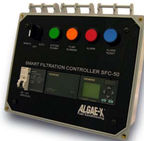
SFC-50 Smart Filtration Controller

Digital flow meter, Rotor Sight Glass, Foot Valve AFC-705 Fuel Catalyst